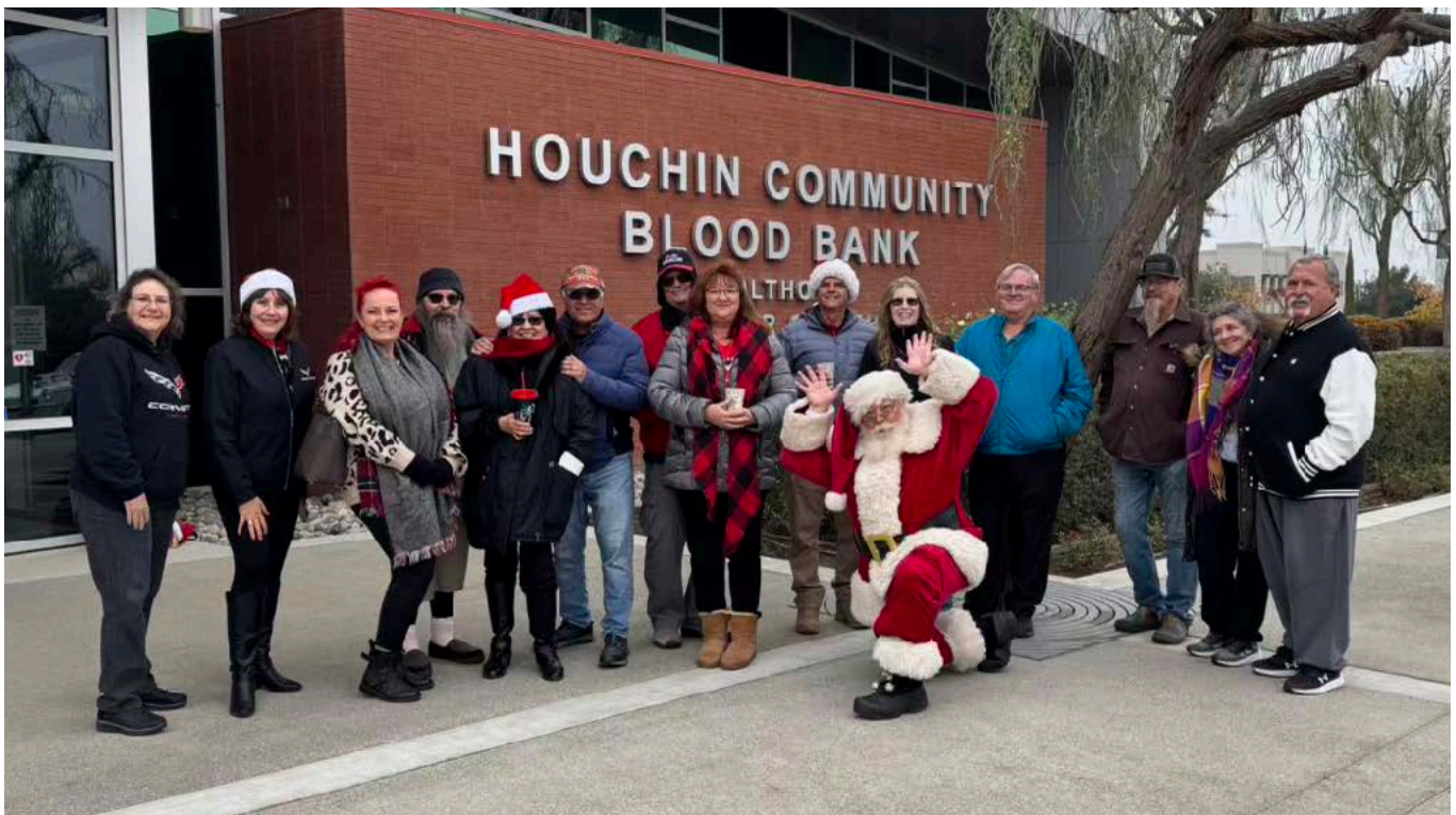
Houchin Bank Blood Drive and Toy Run