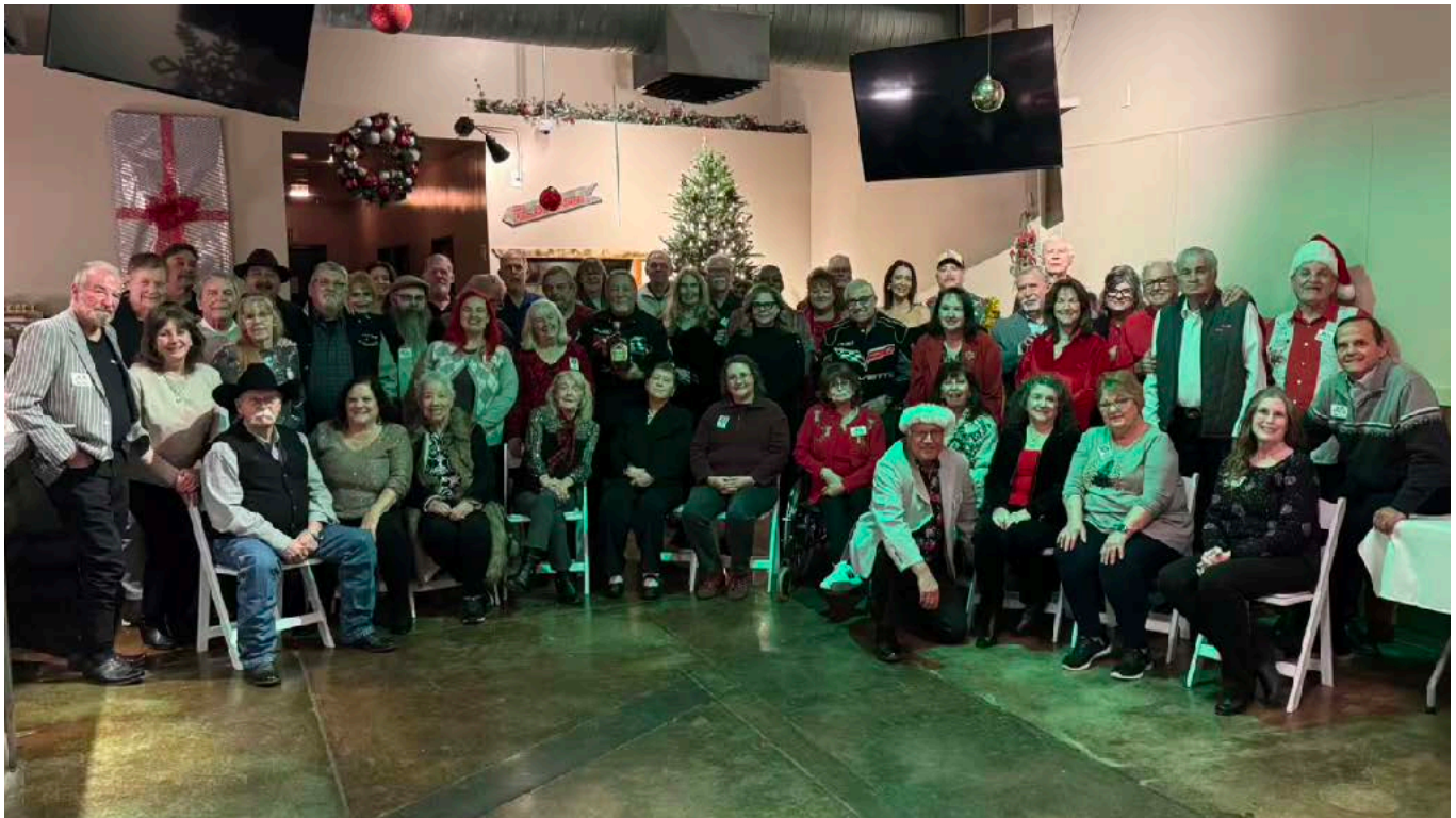
2025 COB Christmas Party