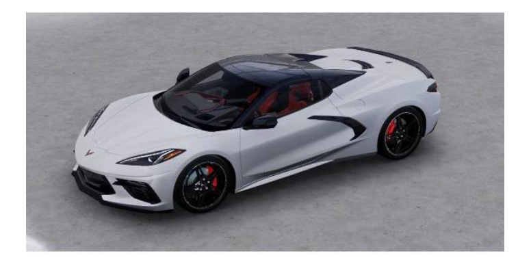
2022 Arctic White Corvette Convertible 4/30/2022

Price: $20.00 Tickets: Unlimited Tickets