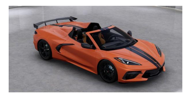
2022 Build Your Own Corvette or $70,000 11/11/2021