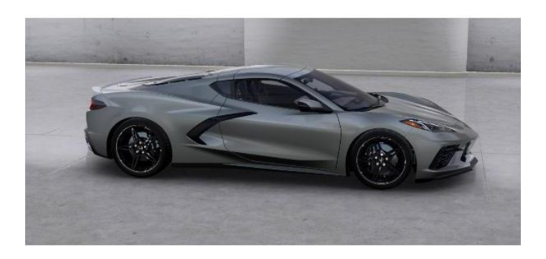
2022 Hypersonic Gray Corvette Coupe 10/21/2021

Below are all the currently active raffles. For additional information and rules regarding National Corvette Museum raffles including how to order tickets and to view the number of tickets remaining available in real time, go to <a href="https://raffle.corvettemuseum.org">https://raffle.corvettemuseum.org</a>.