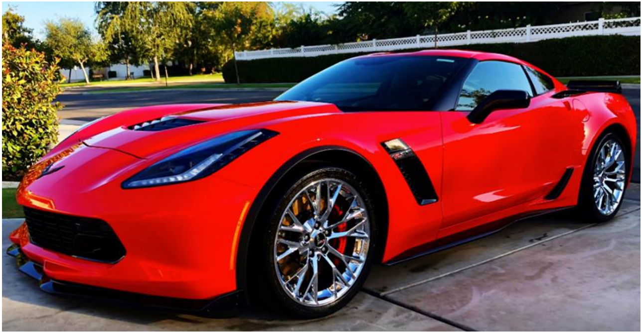
Our current 2016 Z06

We had our 2009 till 2016 when we were window-shopping at Merle Stone Chevrolet in Tulare and fell in love with a 2016 Torch Red 3LZ Z06 which we still have today and enjoy “stretching her legs” as often as possible.