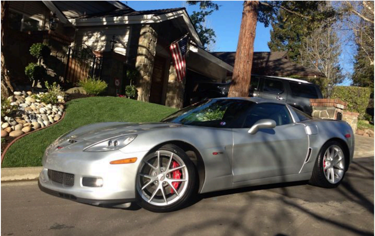
Our 2009 Blade Silver Z06

Our first opportunity came in 2011 while we were living in the Bay Area when we were driving through the sales lot of Dublin Cadillac-Chevrolet looking for a replacement Escalade. We didn't see any Escalade's in the color we wanted so as we were leaving we drove by a silver C6 Z06 and Carol said "we've always wanted a Corvette let's take a look" and lo and behold we were excited owners the next day.