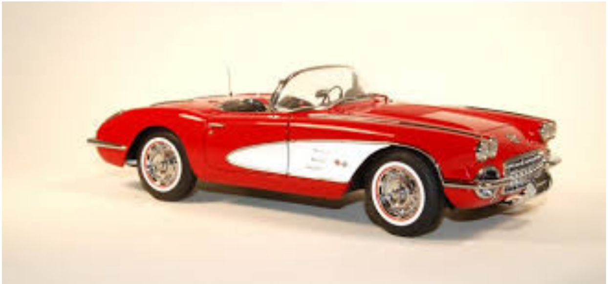
Not the actual car however how I remember the 100 MPH ride as a kid!